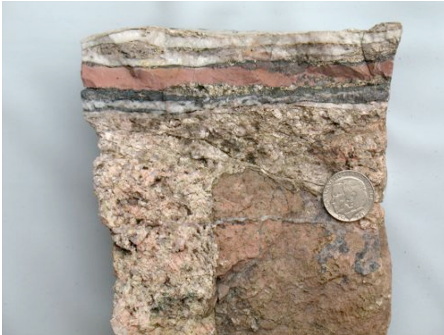
Fig. 33a: Melts of different melting point within the same sample. Coin 25 mm diameter.