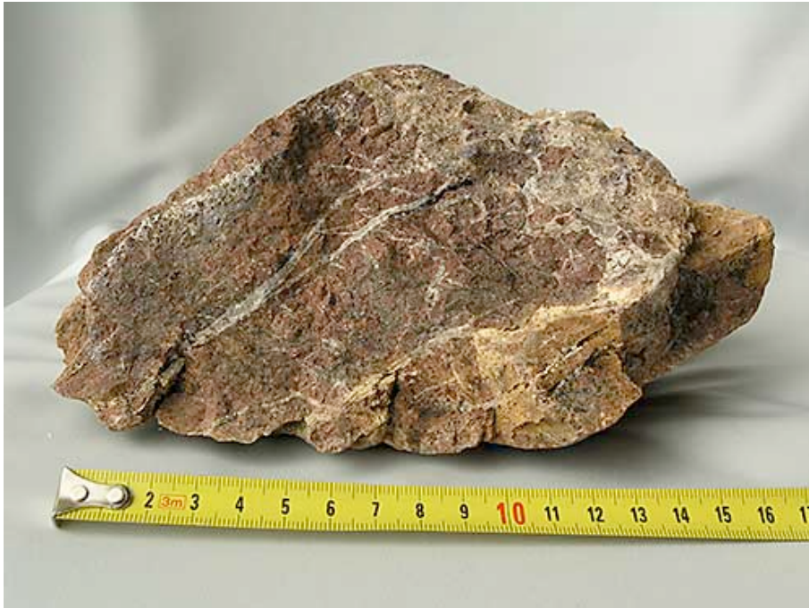
Fig. 23: Metamorphosed melt (Pos. Z).

A further site of finding is a gravel pit at (Pos. Z), where only one interesting piece of a metamorphosed melt has been found, Fig. 23. This piece could originate from the Lake Siljan-astrobleme.