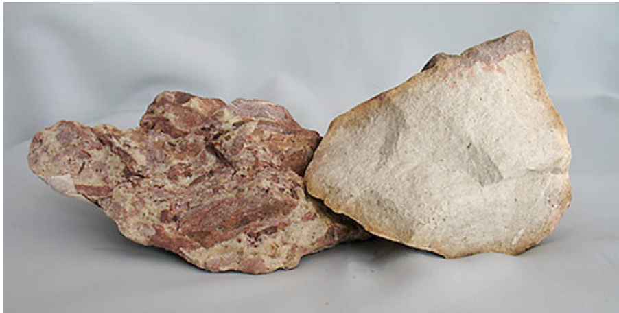
Fig. 34: Right part: Undamaged Silurian sandstone from nearby. Left part: Same sandstone after catastrophic event.

However, there can be another explanation: In the sandstone quarry at Kallmora in the northern part of the Siljan ringdike there exist similar sandstones with inclusions of dried clay, evidently transported there by wind. In Chapter 8. this question will be discussed more in detail under the heading 'An attempt to understand the origin of the Orsa-sandstone'.