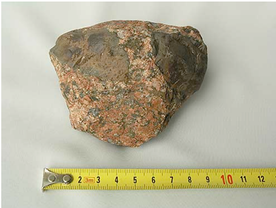
Fig. 16a: Egg-size drops of glass on reconstructed granite, Trolldalarna (Pos. Q).