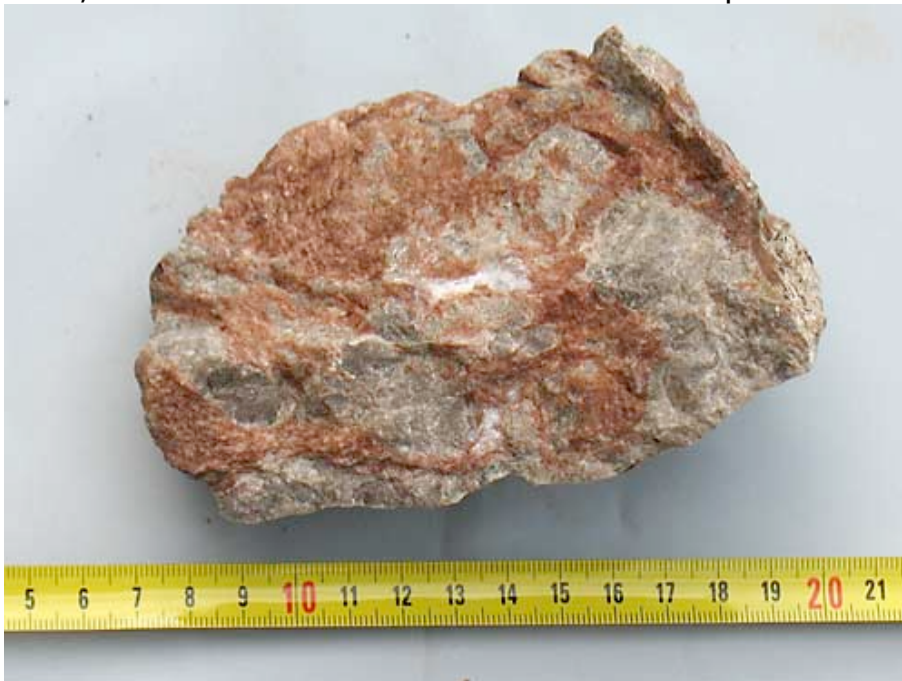
Fig. 42: Pieces of reconstructed brown Orsa sandstone and reconstructed grey limestone. The whole material has been pulverised during the impact. Fresh broken surface of same sample as in Fig. 43.

These figures show the front side and the rear side of the same sample. Note, how distinct reconstructed calcite is separated from the sandstone.