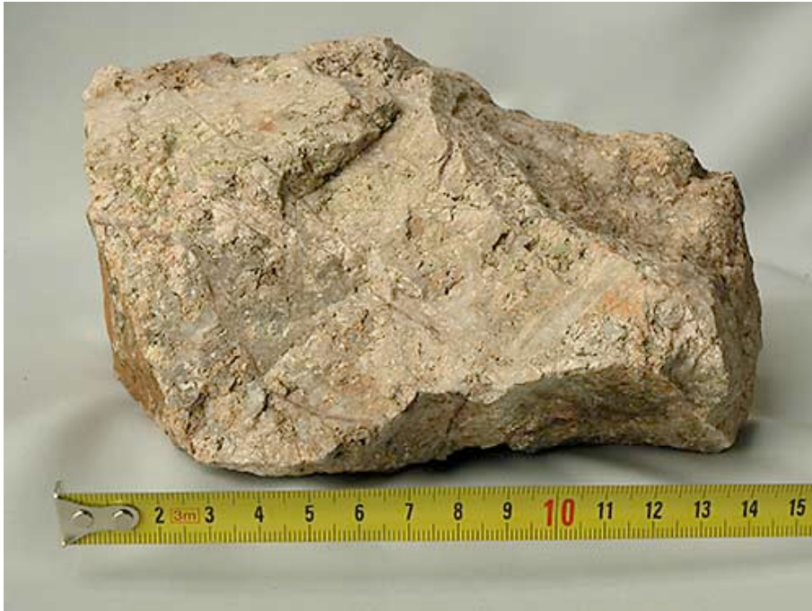
Fig. 5: Crushed granite with innumerable cracks, cured by quartz filling.