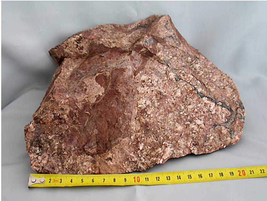
Fig. 31: Left part: Cracks in the solid roof, filled with melt. Right part: Dots of residual eutectic melt.

There is a further peculiarity, to be mentioned: Most of the granite there must have been partly melt right through, having the appearance like pea-soup. The peas were the grains of quartz and feldspar (microcline and albite) and the soup was the liquid phase. During cooling part of the liquid phase crystallized upon pre-existing crystals, until the eutectic composition has been reached and the remainder of the melt solidified instantaneously. Patches of 5 to 10 mm of the brown eutectic melt are seen everywhere, see Fig. 30 and Fig. 31 (right part of figure). This liquid was at the bottom of the crater; its surface finally solidified, like the surface of a magma lake in a volcanic crater. Slides or other tectonic movement has cracked the solid surface, the underlying (near eutectic) melt poured up and filled the cracks, see left part of Fig. 31, but also Fig. 29. Between the instant of meteorite fall and filling cracks in the solidified surface there can be many years. Due to fast cooling this second melt is very fine-grained and does not contain fragments of the side-rock, like in the samples from the Lake Siljan astrobleme.