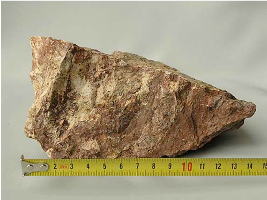
Fig. 4a: Weathered melt, probably exposed to steam (Pos. B).

In addition, there is a new site of crushed and quartz-annealed granite at the Lake Siljan shore, belonging to the village Garsås, (Pos. C). Annealing of meteorite-damage by quartz differs from that of structural movement, since in the first case the boulders are criss-crossed by the quartz-veins, whence in the other case there is only one (1) direction of quartz annealing. At (Pos. C) there are so many boulders that the outcrop has to be close; best it is seen at low-level water. At this site one can find: