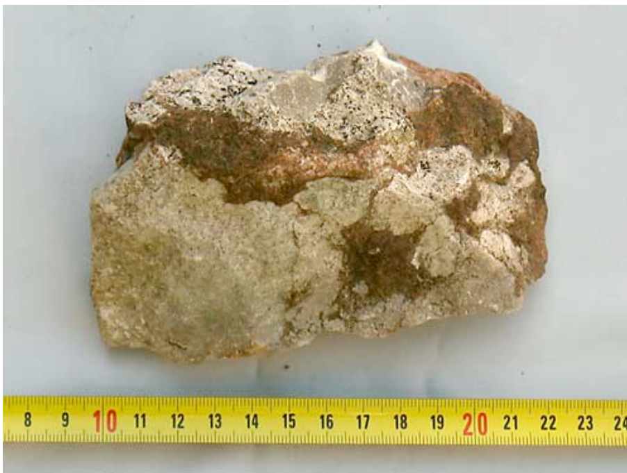
Fig. 43: Same sample as in fig. 42, but surface exposed to erosion. Pieces of reconstructed limestone separated from reconstructed Orsa sandstone