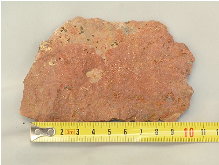
Fig. 19c: Same pseudotachylite as in figure 19b, the rear side rich in melt.