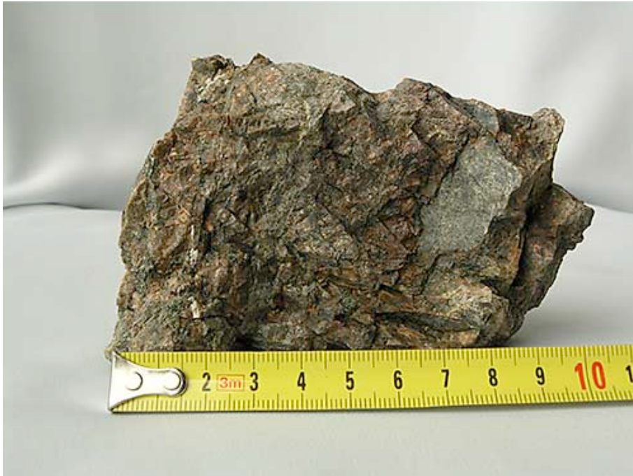
Fig. 27: Brown dyed quartz with inclusions of chlorite slate (Pos. Aj).

Most probably we are looking here inside the bedrock on a portion, which had been very hot for thousands of years and percolated by steam. This has broken down remainders of feldspar and changed the Tretaspis layer to chlorite. The question is, if this is due to a local astrobleme (the Leksand-astrobleme), or to the nearby Lake Siljan-astrobleme. The distance from the quarry to the centre of the Siljan-astrobleme – as we define it – is 25 km.