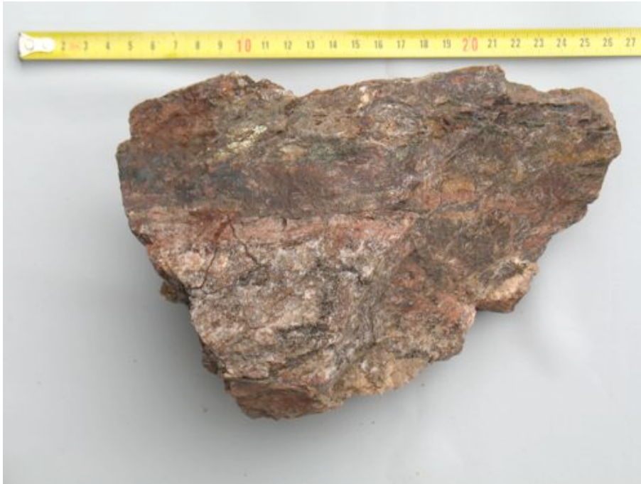
Fig. 38: Rear side of sample Fig.37

It is known that previously there has been a pressing of more westerly rock massives with a force vector pointing easterly. This effect is seen in the sandstones (quartzite) near Malung. These are bent or raised up to vertical position, but not sheared. This effect could explain the tachylites, but not the massive melts in the second type of material. Therefore the question of the origin of these peculiar rocks is unresolved.