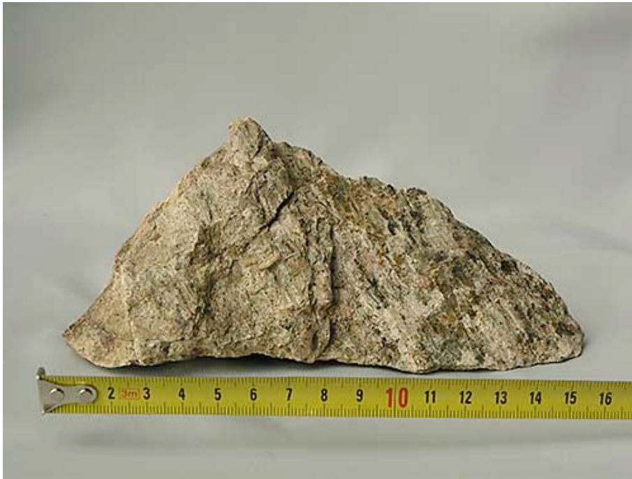
Fig. 2: Gliding in sheared granite (Pos. B).

difference to porphyry: Phenocrysts in porphyries are monomineralic; here the melt contains fragments of the target rock, consisting of several minerals (Fig. 1). This is the final proof that the Siljan ring is an astrobleme.