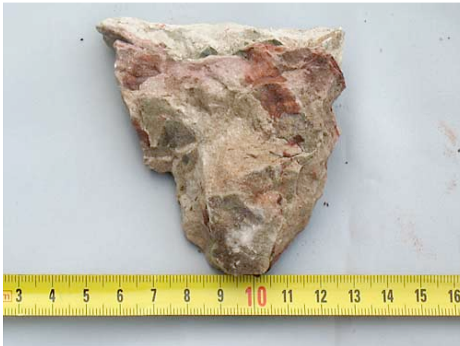
Fig. 39: Orsa sandstone from Kallmora. Upper part: Undyed white sandstone. Middle part: Sandstone dyed by pulverised microcline

-The purest samples consist of white quartz grains and a varying content of calcite (right part of Fig. 34). Other samples, particularly those from the quarry at Kallmora, are dyed red-brown of different shades. Even rose samples, dyed by pulverized microcline occur; see Fig. 39. Further there occur samples, rich in fragments of dried clay; these fragments have no order in-between, see Fig. 40. There exists a mix of dyed and white sandstone, too, see Fig. 41. Evidently volumes of heavily dyed loose sand got in contact with another volume of white sand.