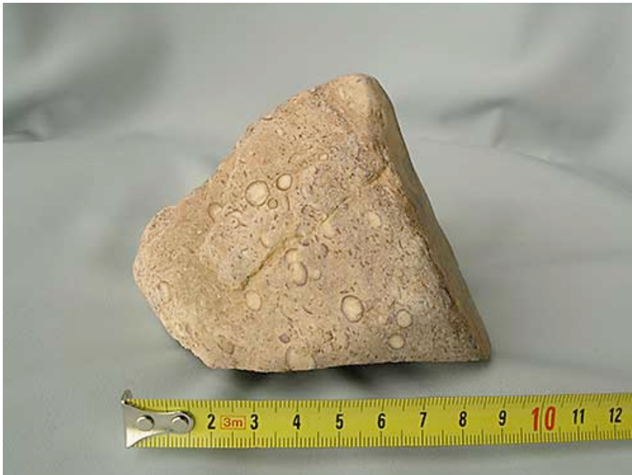
Fig. 22: Silicified pieces of stems of a crinoidea in quartz-rich matrix.

A further site for finds is a forest road, leaving a larger forest road at (Pos. Y) and climbing up to its end at 340 m height. Along this road impact-affected material can be found. One find is a block of brown coloured (former) quartz jelly, which contains silicified pieces of the stem of a crinoidea, Fig. 22.