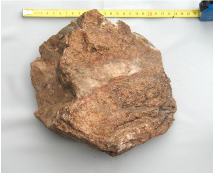
Fig. 13a: Recrystallised 'ashes' from Lake Flosjön-astrobleme