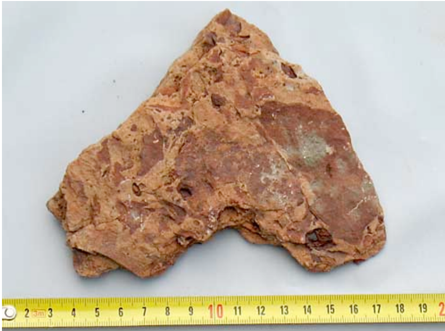
Fig. 40: Orsa sandstone from Kallmora. Light brown background: Mixture of the dying agent and white quartz. Dark brown spots: Residues of the clay formed in depressions before the avalanche, that mixed the unconsolidated airborne sediments