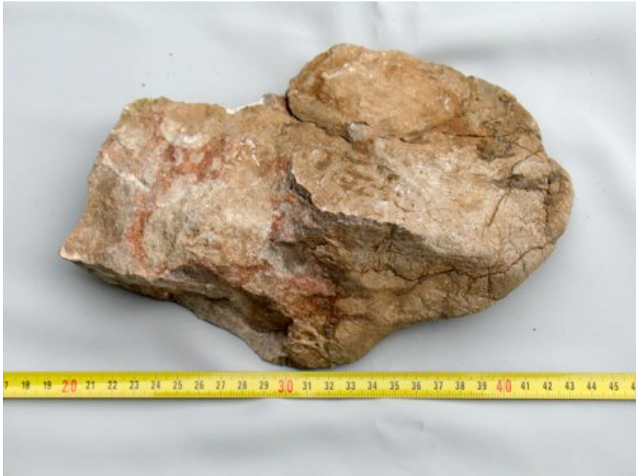
Fig. 27b: Reconstructed calcite (Rear side of sample Fig. 27a)

At the same location there are several boulders, consisting of the brown-red microcline and epidote, only. The epidote is light green in colour and must have been a melt/liquid, since it penetrated the mesh of loose feldspar crystals as a vein. Note that the microcline is definitely darker than normal in granite or pegmatite. The veins contain fragments of the feldspar and of other epidote-minerals like orthite. See Fig. 27c.