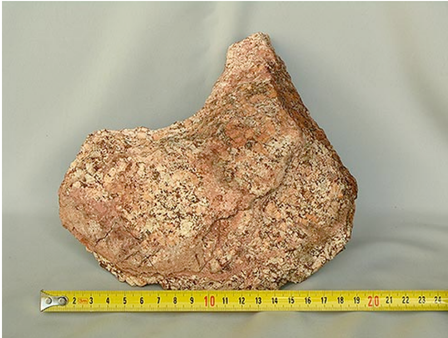
Fig. 30: Red-brown melt and reconstructed granite (Pos. Ap).

The most convincing evidence for an astrobleme are blocks rich in melt (see Fig. 30 and Fig. 31). They occur scanty, but can be found. Those, this author has found, contained very much melt, which is completely different from that at other sites. Due to a rich content of tiny black particles the melt is gray. The particles – size some tenths of a millimetre – look like hematite, but are magnetic (= maghemite). Some parts of the quartz layers are dyed pink like by erythrine. Diffraction analyses, made by Riksmuseet (Doc. Skogby) showed, that the pink layers consist of the mineral piedmontite. Black dikes appear, too.