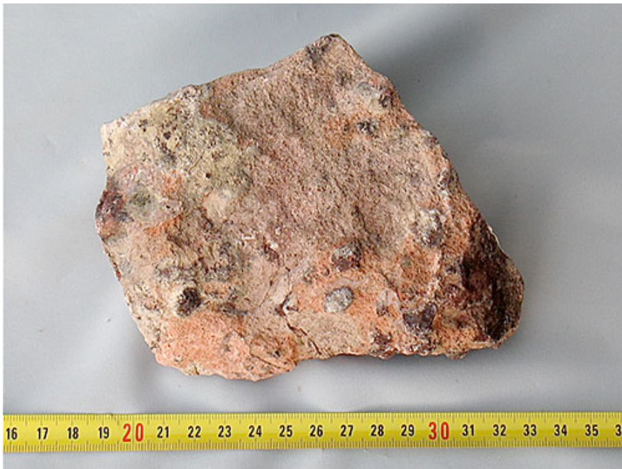
Fig. 28: Orange "volcanic" ash

the village Rågsveden. The forest road heads to the east. After about 5 km at (Pos. Ap) one is in the middle of a large deforested area at the highest point of the road. There from the whole field of prospecting can be overlooked. East of that point is an area that has been cleared by fire from shrub and vegetation on ground. There all boulders are clean from lichen and mosses. There almost all boulders have a reddish-brown appearance and most of them are affected by the astrobleme. The unaffected granite there has a grain size of about 5 mm with pale-orange potash feldspar, white albite and clear quartz in same proportions. The affected stone shows pseudotachylites, which often consist of three layers: The middle layer consists of the brown melt, boarded by later layers of quartz. This damage is quite easily found.