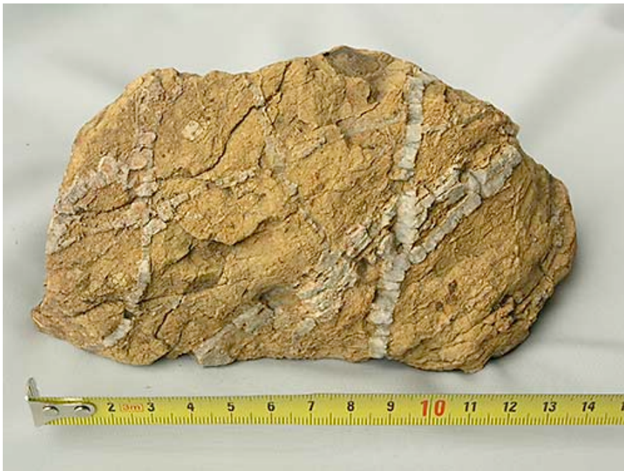
Fig. 11: Weathered and water-transported fine stuff (Pos. P).