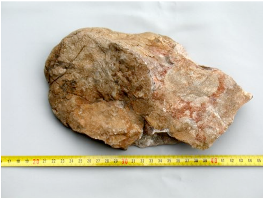
Fig. 27a: Reconstructed calcite from north side of Lake Ljugaren

At (Pos. Bi), about 100 m north of the forest road beginning at (Pos. Bj), there is a block of Ordovician calcite, weighing about 50 kg. It has no detectable layering, consist of a sintered mixture of calcite- and quartz powder. To survive under geological times it must have been covered by other debris, originating from the fall of the meteorite. Since the border of the Siljan-meteorite is not very far away, it could originate there from or belong to the supposed Ljugaren-meteorite. See Fig. 27a and Fig. 27b.