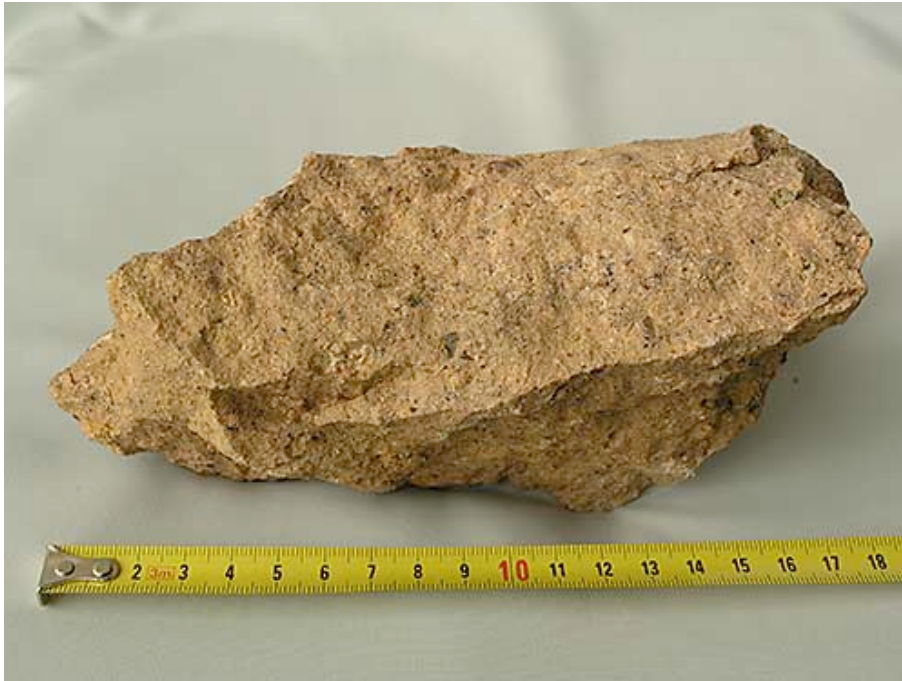
Fig. 7: The sample resembles sintered 'volcanic' ash (Pos. G).

At (Pos. G), near a dead birch, there lie two boulders. One of them is very similar to the impact-melt breccias from the Siljan region (Fig. 6). The elongated sample is from the Stora Flaten-astrobleme, the rounder from the Siljan region at (Pos. A). The other boulder from the dead birch (Fig. 8a) has another character, not found in the Siljan-region. It resembles a pyroclast like one from the Azores or from south of Rome. It consists of small granite fragments in a yellow ash and probably is a suevite. Please leave these boulders untouched as examples for other visitors. There is no problem to find similar samples on the burned spot.