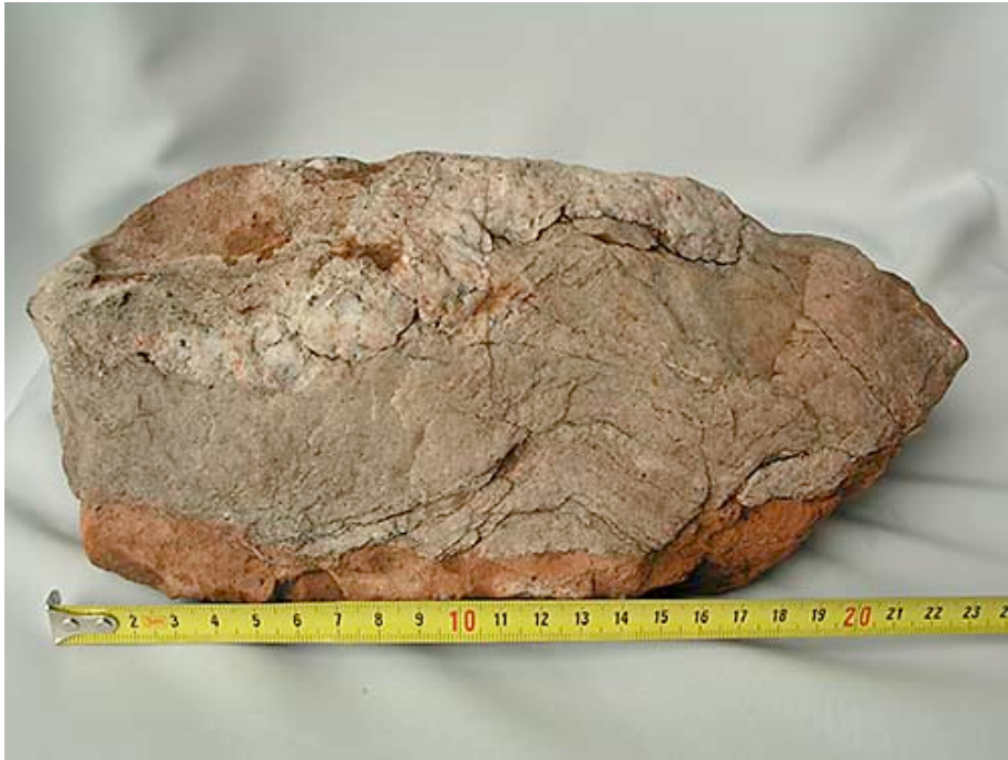
Fig. 12: Layer of tumbled granite pieces on fine stuff (Pos. P). On downside weathered melt.

Likewise there is a dark red metamorphic rock, consisting mainly of red microcline and small amounts of epidote, almost free from quartz, Fig. 13. Despite this rock is similar to red porphyry, it is free from a glass phase. Similar red microcline is formed in fracture zones from the stone powder. Here and there on the sites there are boulders of the similar Garberg granite or Garberg porphyry from a site about 75 km NNW, and for this reason the red metamorphic rock could be a fraction from Garberg. However, this red metamorphic rock is found at all sites of impactites, only, which makes the Garberg origin somewhat questionable. One can imagine that a hot-water fluid had leached powdered granite. The fluid has removed all quartz and left behind the potash-feldspar powder, which later on metamorphosed to the red rock.