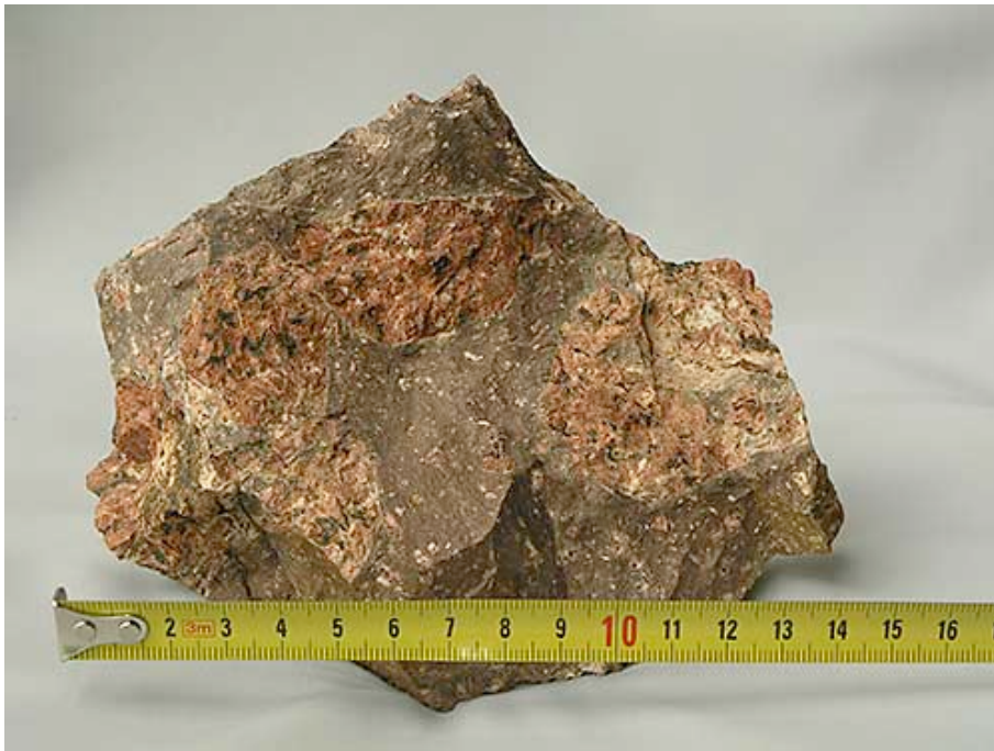
Fig. 1: Impact-melt breccia from (Pos. A).

During exploration for Natural Gas twenty years ago in the centre of the Siljan ring an outcrop has been discovered (Pos. A), consisting of the solidified impact-melt. Unfortunately this author does not know, who has made this discovery and if it is published. For this reason it is here unsuitable to mention the coordinates of that outcrop.