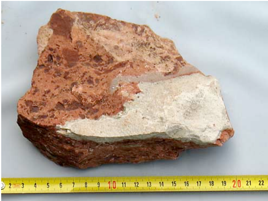
Fig. 41: Orsa sandstone from Kallmora. Three grades of brown sandstone, in contact with white massive white sandstone

The geological regional map /13/ around the astrobleme shows a ring dike of Ordovician and Silurian sediment, that have been preserved in the dike formed by the impact, described by Melosh /11/ as a 'peak ring crater' in his