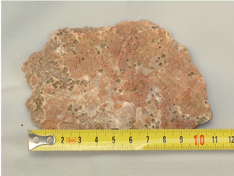
Fig. 19b: Layer of pseudotachylite, quartz-rich side, 5 mm thick.