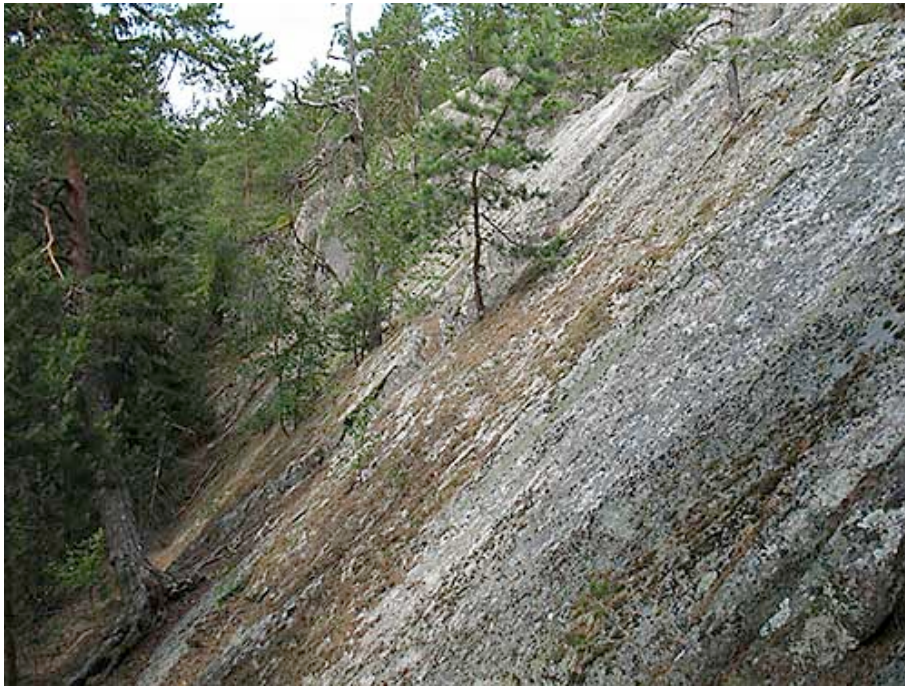
Fig. 25: Tilted sheet of Käringberget, west side.

lot) and 10 m to the west one reaches the brink of a formerly horizontal plate of granite, now dipping at 60^{\circ} W and striking 30^{\circ} W. The top of this plate is about 75 m above the level of the railway east of it, i.e. above the valley level; the foot of the plate disappears in moraine boulders, see Fig. 25.