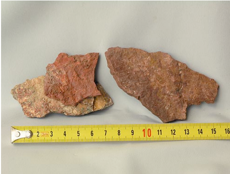
Fig. 19d: Two pseudotachylites about 5 mm thick.

There exists much evidence for that the bedrock in the quarry has been affected by an impact. This could be an impact by itself (the Långsjö-astrobleme) or due to the damage done by the Siljan-astrobleme.