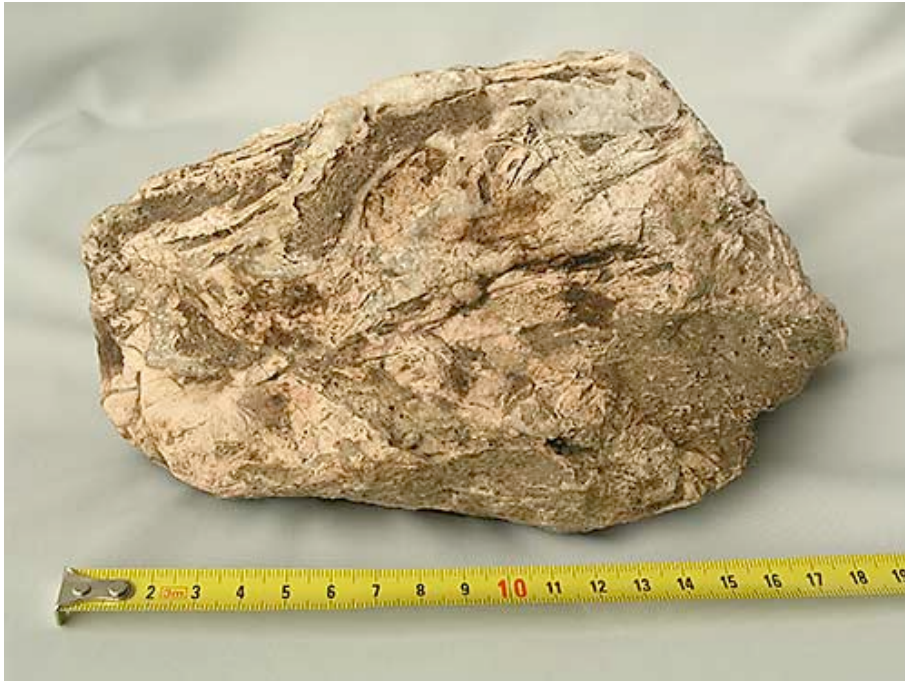
Fig. 10: Nice sample of water-transported secondary impactite (Pos. P).