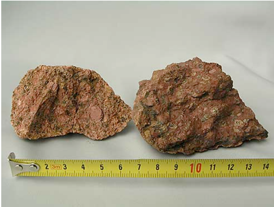
Fig. 13: Very dark red microcline like that formed from mylonite in a slip cracks. The dark dots are rounded grains of quartz.

Recently (in 2010) a new area nearby has been ploughed and thus has disclosed plenty of impactgenerated samples. It is at the previously mentioned turning for Forsbodarna, but south of this turning. There every second stone or boulder is affected by the impact. Fig. 13a shows a quartz-free sintered ash or sediment with an overcrossing wide quartzvein. Fig. 13b shows the red brown feldspar-residue. This ploughed field is an unlimited supply of impact-generated samples.