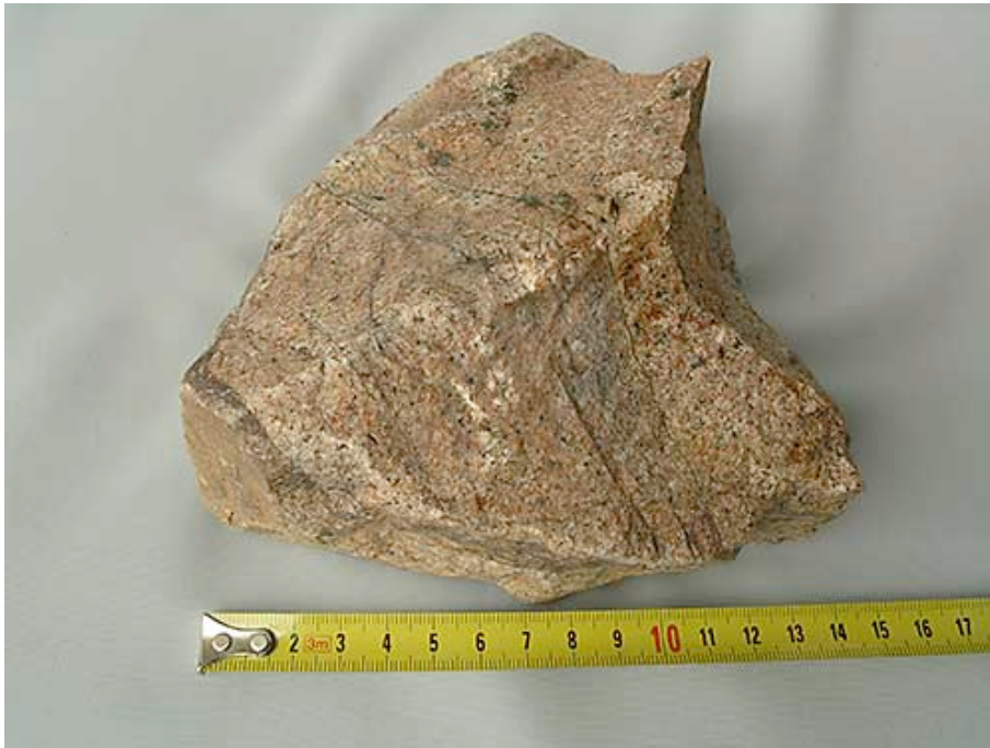
Fig. 21: In all directions cracked and quartz-cured granite (Pos. T)

A further site for finds is a forest road, leaving a larger forest road at (Pos. Y) and climbing up to its end at 340 m height. Along this road impact-affected material can be found. One find is a block of brown coloured (former) quartz jelly, which contains silicified pieces of the stem of a crinoidea, Fig. 22.