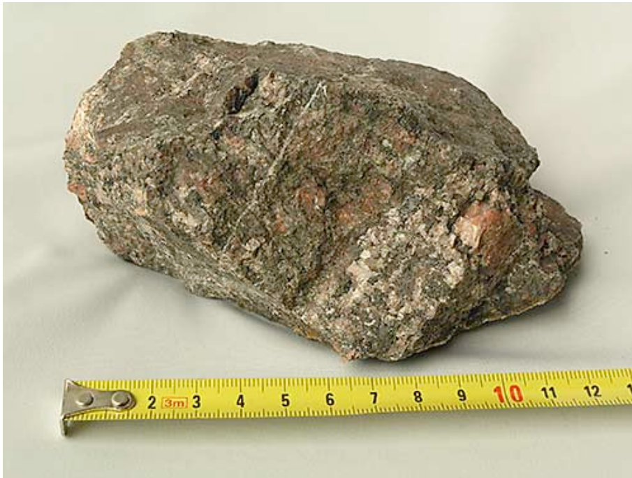
Fig. 9: Plenty of dark glass in this sample. The white dots are calcite and a calcium-silicate (Pos. N).

Along a recently built forest road N of the summit of Bodberget in the valley of the brook Nordanbergsängs-bäcken (Pos. O), there are further boulders with cracks, filled with pseudotachylite. However, the richest site for finds is quite near at (Pos. P), which is an area ploughed some years ago, where the trees have been cut down. It is about 100 m W of the turning for Forsbodarna. There almost every block or boulder is affected by an impact; mostly you will find secondary impactites of type 2.3 of our classification. Fine-grained material seems to have been collected at a particular site and later sledded downhill, forming a rock, similar to subaquatic turbidities, see Fig. 10, 11 and 12.