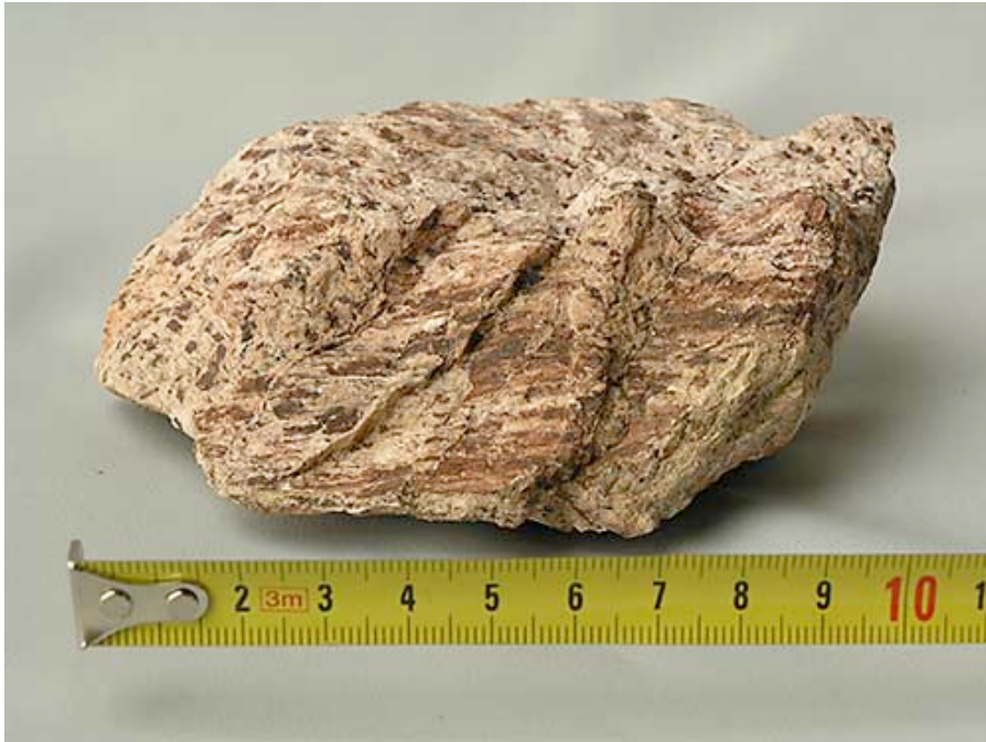
Fig. 3: Pseudotachylites in sheared granite (Pos. B).

During the 1960:s the only evidence for the astrobleme hypothesis was the ring trench, shattered and tilted sheets of carbonate rock from Ordovician and shatter cones in the centre of the structure. Since then it has been shown, that shatter cones are not at all so rare, but can be found here and there, e.g. in the till at the edge of the Lake Siljan near the village Stumnsnäs, there at a stone pier (Pos. D). Some 100 m NE of that point there is an outcrop on the shoreline (visible only at low water level), consisting of crushed granite in carbonate-silicate slurry.