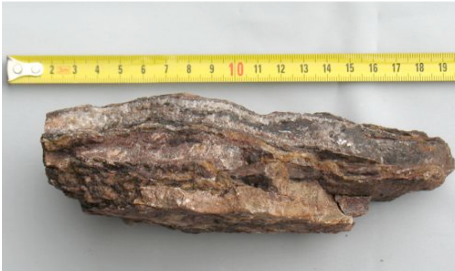
Fig. 36: Melt (pseudotachylite) from Lake Kvien