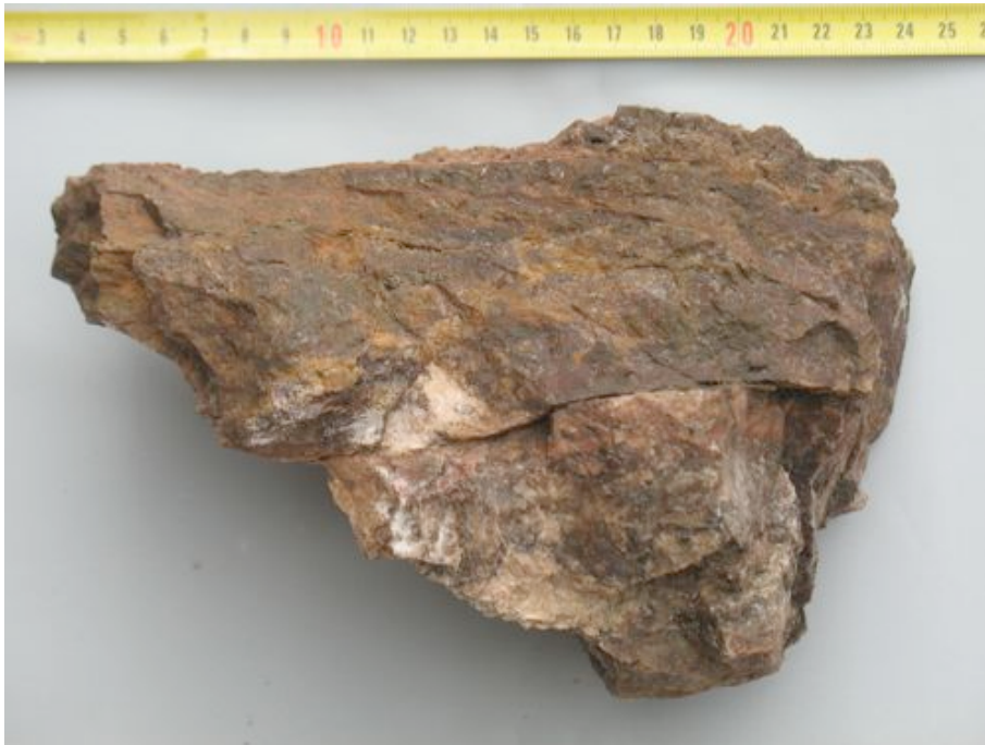
Fig. 37: Melt from Lake Kvien