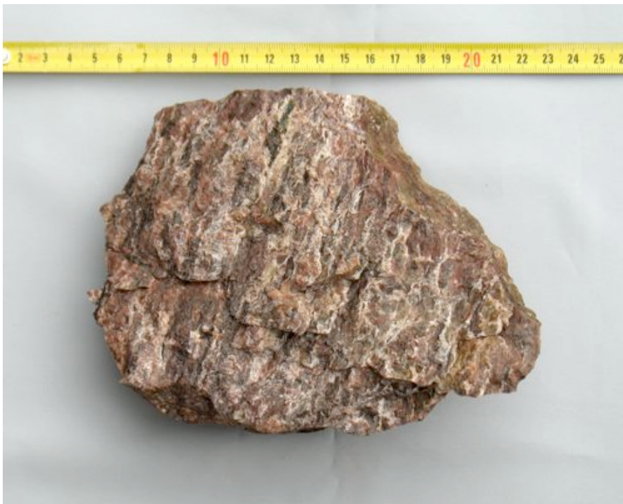
Fig. 35: Sheared stone sample with tachylites from Lake Kvien

-The second type is a brown stone, containing substantial quantities of a melt phase on both sides of an intruding quartz vein. This is seen in Fig. 36. Figures 37 and 38 are the opposite sides of the same sample. Also here by visual inspection melt material is seen. This type of material is not as common as the tachylites.