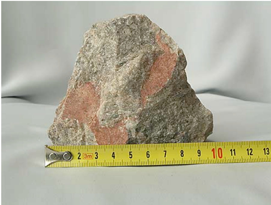
Fig. 26: Pseudotachylites at (Pos. Aj).

The most interesting place is a quarry near the road Rättvik-Falun at (Pos. Aj). It is situated on the rim of the supposed astrobleme. In this quarry for macadam all types of rock exist: Granite, a rock consisting mainly of coloured quartz and a black dike, to day consisting of chlorite slate (might have been black shales from the Ordovician Tretaspis layer). Also a few pseudotachylites occur, see Fig. 26. The distance to the centre of the Siljan-astrobleme is 25 km. The quartz is of a glassy variety, clear but dyed, hard and brittle like pegmatite. Pseudotachylites are few, probably because they have been destroyed later during their life. There is a brown rock, looks like porphyry, with inclusions of cm-large fragments of the chlorite slate. To this author it appears, that the "porphyry" is not at all porphyry, but consists of brown-dyed quartz, which has absorbed fragments of the chlorite slate, see Fig. 27.