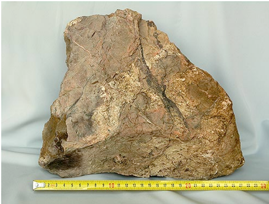
Fig. 29: Pink grey parts: Melt; light parts: Damaged original granite (Pos. Ap).

because completely free from free quartz and therefore a syenite. Its texture looks by free eye as a melt; at 10 times magnification one sees that the matrix consist of inter-grown feldspar crystals with local cleavage. The colour is deep red-brown, like microcline from mylonite. A tentative explanation of this rock is the following: The impact of the falling meteorite has pulverised the bedrock and created high local temperatures. Steam leached this slurry, removed quartz (therefore so much quartz annealing at other sites) and left the pure feldspar slurry to recrystallize. This red-brown rock is found at sites of astroblemes, only. The hypothesis explains, too, the heavy occurrence of free quartz at (Pos. Aq) in the Siljan-astrobleme, where blocks of several hundreds of kilograms of pure milky quartz can be seen.