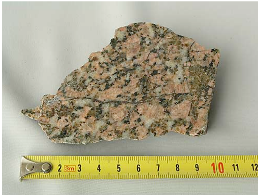
Fig. 14: Sawed plate of restructured granite from Trolldalarna (Pos. Q). The dark filling is glass; these fillings are interconnected.

At the same site (Pos. Q) another stone has been found, which – after deliberate crushing – showed grains of granite floating in a dark-brown melt, see Fig. 16b. There are white grains in the mixture, too, which proved to be calcite. How can calcite enter reconstructed "granite", if not mechanically after the original granite has been shattered to small fragments? This site is near the centre of the impact: Its force there has acted vertically downwards and had only a small component of sheer aside, which is found in more peripheral locations. This could be the explanation for the resilient glass-impregnated granite.