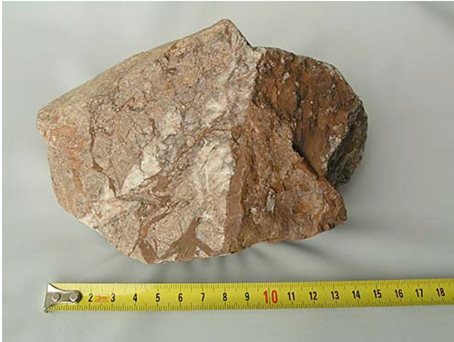
Fig. 15: Glass in hard rock from Trolldalarna (Pos. Q).