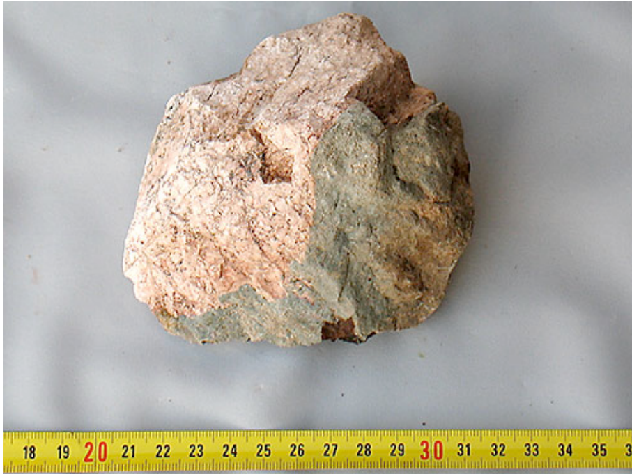
Fig. 32: Even blocks of dolerite, which happened to be at the site of impact, have been remelted and form a sharp zigzag border with the partly melted granite.

Fig. 33 from the Hummelsjö-astrobleme shows a large piece of granite, containing fragments of pieces of flint-like rock. The flint has been broken into fragments by an instantaneous melt, that has enclosed the flint. There is no sign of melting or digestion of the flint, like it is seen in other sites, where a granite magma advances and gradually digests the country-rock. Compare this figure with Fig. 8a from capture 7.2. In the Hummelsjö-sample the granite was not completely melt, but consisted of crystals, floating in a partial melt. In the former Lake Stora Flaten-sample Fig. 8a the melt was hotter and formed a single phase liquid.