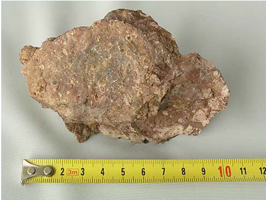
Fig. 18: Rear side of right-hand sample in Fig. 17 showing the flint-like stuff.

Two kilometers south of (Pos. V) there is another one (Pos. W) within a small, protected area – Björberget - that is extremely rich in hepatica. This site is so far away from the Lake Siljan astrobleme that in this granite a local source of carbonate must exist, either a residue of the original cover of carbonate or boulders of carbonate, transported there. Transport from the Siljan-astrobleme is extremely improbable. A thick cover of soil makes the excavation difficult. Pseudotachylites are found, too, in very fine-grained granite along a forest road at (Pos. Ao).