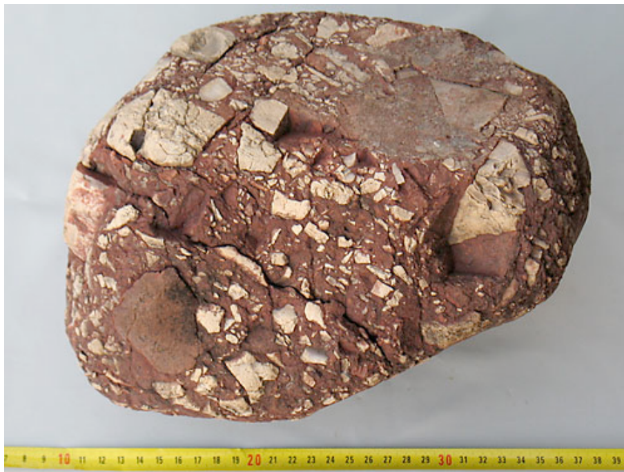
Fig. 8b: Boulder consisting of flintpieces, wrapped in red-brown melt. Part of the Inclusions is flint

At the northern shore of Lake Stor-Flaten a very interesting observation has been made. The lake has quite clean water, somewhat dyed by humus, but low in nutritive salts. Also its level varies due to damming. This prevents the establishment of algae on stones at the water's edge. Between (Pos. Av) and (Pos. Aw) on the shore almost every stone/bolder has been affected by the impact. However, most interesting is a rather rich occurrence of layered flint. Real flint is in Dalecarlia a very rare mineral (chalcedony), is much rarer than e.g. the rare alkaline volcanic rock tinguaitite. Where from comes layered flint? The answer must be: From Ordovician or later up to Devonian limestones. These contain radiolaria, the quartz of which concentrates by metamorphosis in bands within the limestone beds. This certainly happened in the whole sedimentation basin, but has been preserved, only, under the ashes of an astrobleme. The flint is white, greenish or peach.