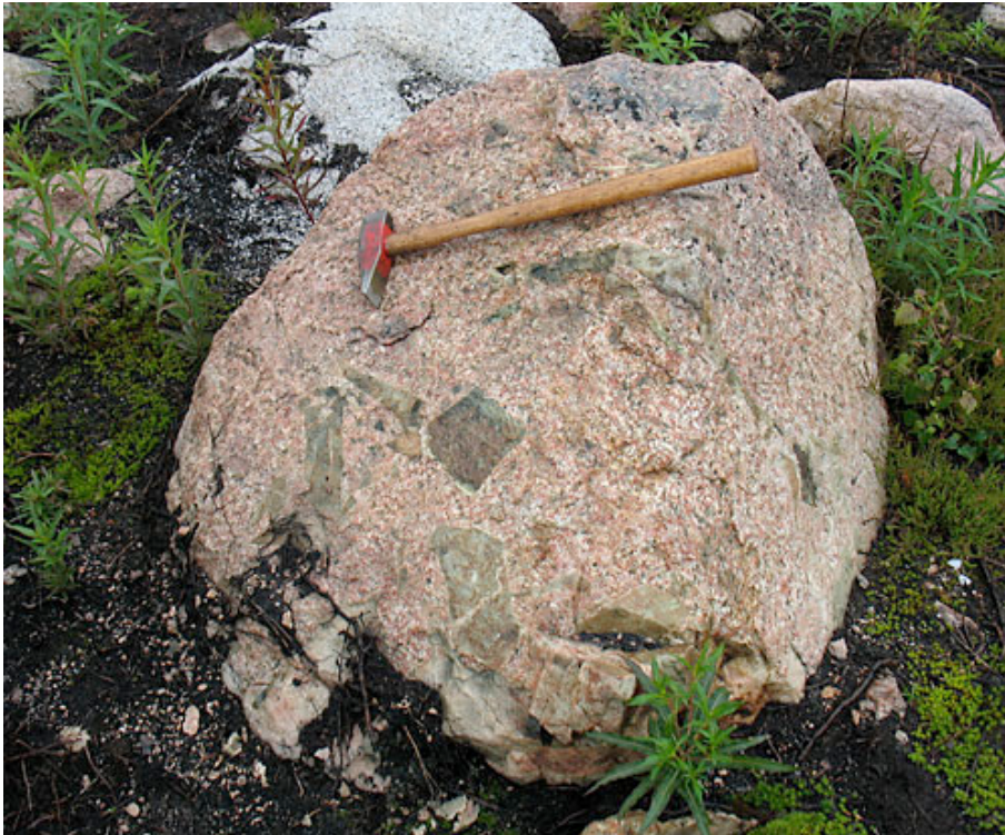
Fig. 33: Partly melted and afterwards recrystallized granite containing pieces of flintlike rock.

A recent find – see Fig. 33a – shows the in time different processes in this astrobleme. The brown melt right in the picture, which solidified first, was intruded by a thin (in the picture horizontal) quartz-vein. Next a semifluid 'paste' engulfed the brown piece, solidified finally. Last a quartz-vein of different color broke through the now solid 'paste'. Probably in time different pulses of quartz-solution used the same fissure and deposited their color. Between two of these a lens-like residue from the 'paste' is seen. This shows that – hidden by a cover - there existed different melts long after the impact. Compare this with Fig. 33.