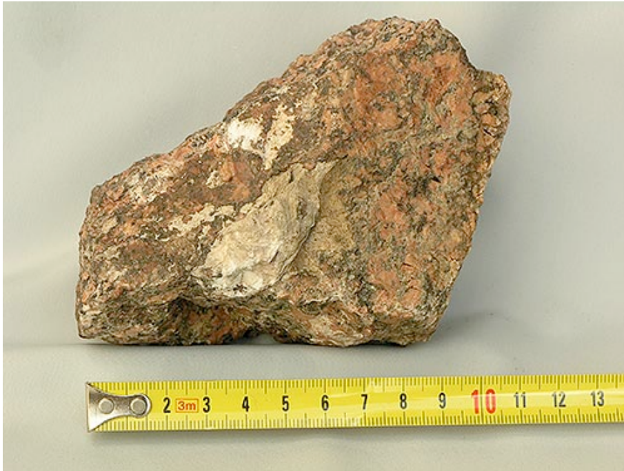
Fig. 16b: Mechanical calcite inclusions in reconstructed granite, Trolldalarna (Pos. Q).

Recently (August 2010) at (Pos. Q) several large blocks of shattered granite, cured by a melt, containing large inclusions of that melt have been found, see Fig. 16c. These samples are comparable with the bests from the Siljan-astrobleme.