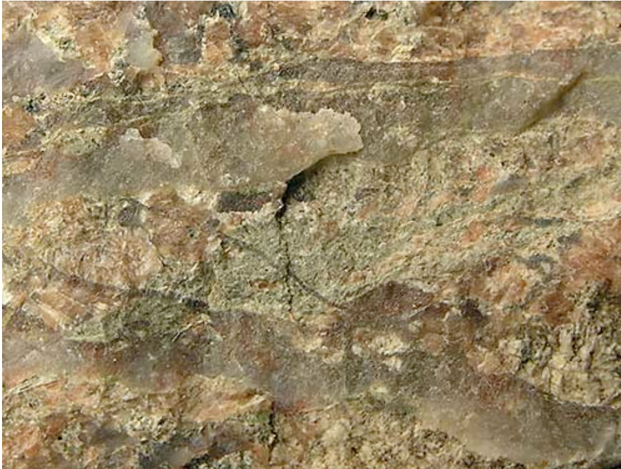
Fig. 19a: A melt phase between the two quartz veins.

saturated water to penetrate the crack. Tectonic movement is far too slow to generate so much cracks and glass and does not generate crushed granite, which later on is sealed together by quartz solutions in water.