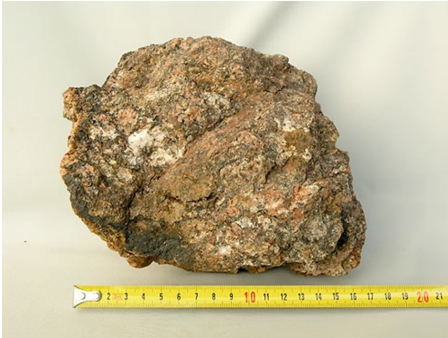
Fig. 8a: The sample contains a darker melt than that from Lake Siljan and some agglomerated calcite (Pos. H).

In the same pit there is a larger – not transportable - boulder with quartz curing and dark glass. Note that the everywhere present boulders of the local granite are quite different from our astrobleme samples.