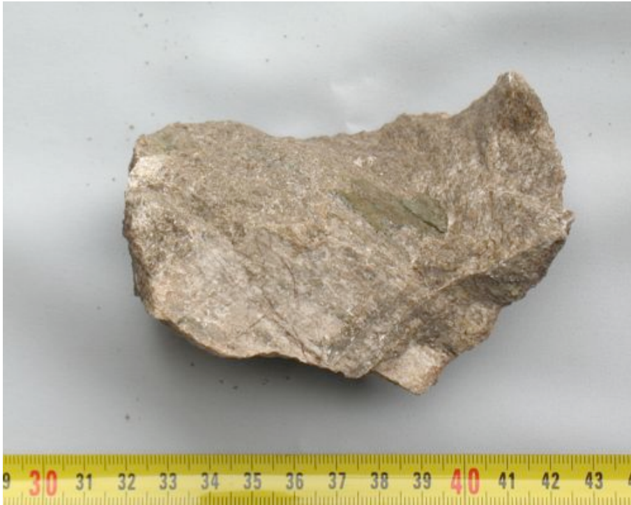
Fig. 27d: Sample of reconstructed Ordovician calcite