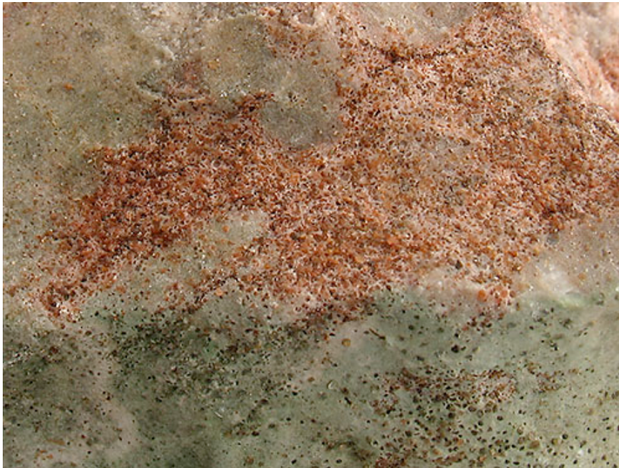
Fig. 4b: Reconstructed calcite from (Pos. Ar). Real lengths of view is 3,5 cm.

A similar bolder of reconstructed calcite is exposed outside the public library at Rättvik. In this paper the term 'reconstructed rock' is used for similar formations. See Fig. 4b.