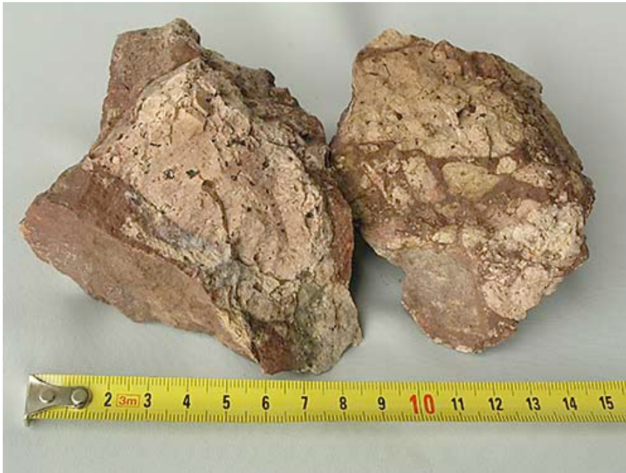
Fig. 17: Conglomerate consisting of balls of flint-like stuff in a matrix similar to impact-melt.

The conglomerate from (Pos. V and G) is completely different from ordinary conglomerates: The round inclusions consist of an amorphous material like flint, but contain round cavities like gas-bubbles. These are partly filled with crystals. One gets the impression of a solidified, devitrified glass with gas inclusions, Fig. 17 and 18. Fig. 18 is the rear side of the right sample in Fig. 17. The matrix of the conglomerate is the brown stuff like in Fig. 4a. Could this be some late agglomeration of original impactite material? Ordinary conglomerates do not contain balls of amorphous material with gas bubbles!