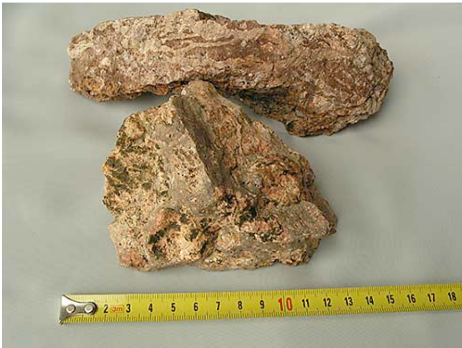
Fig. 6: Impact-melt breccias. The elongated sample is from (Pos. G), the round one from the centre of the Siljan-astrobleme.