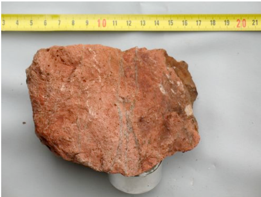
Fig. 13b: Microcline-rich 'ashes' from Lake Flosjön-astrobleme

A further location for finds is the centre of the Lake Flosjö-astrobleme at Trolldalen. There, in addition to giant scale boulders, at (Pos. Q) an old gravel pit with heaps of discarded stones and boulders occurs. This material – as everywhere in gravel pits - is water-transported to the very site, therefore not typical for the bedrock just below. There exist stones of the