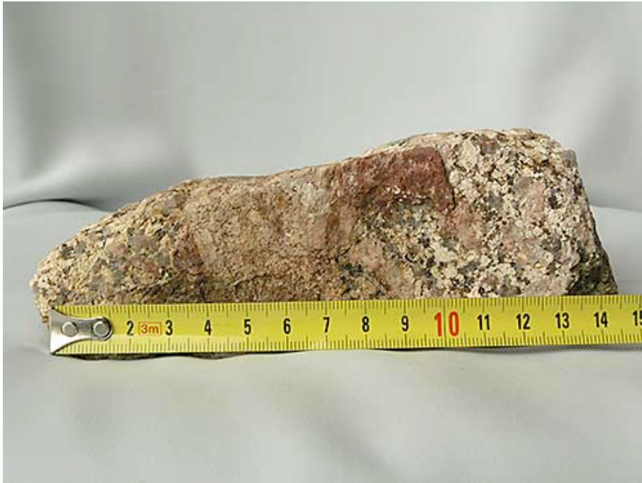
Fig. 24: Pseudotachylites at (Pos. Ab).

At (Pos. Ab), in an amelioration cairn, there are stones with undeniable traces of pseudotachylite, Fig. 24. A further site for finds is near the village Siljansnäs in an amelioration cairn (Pos. Ac).