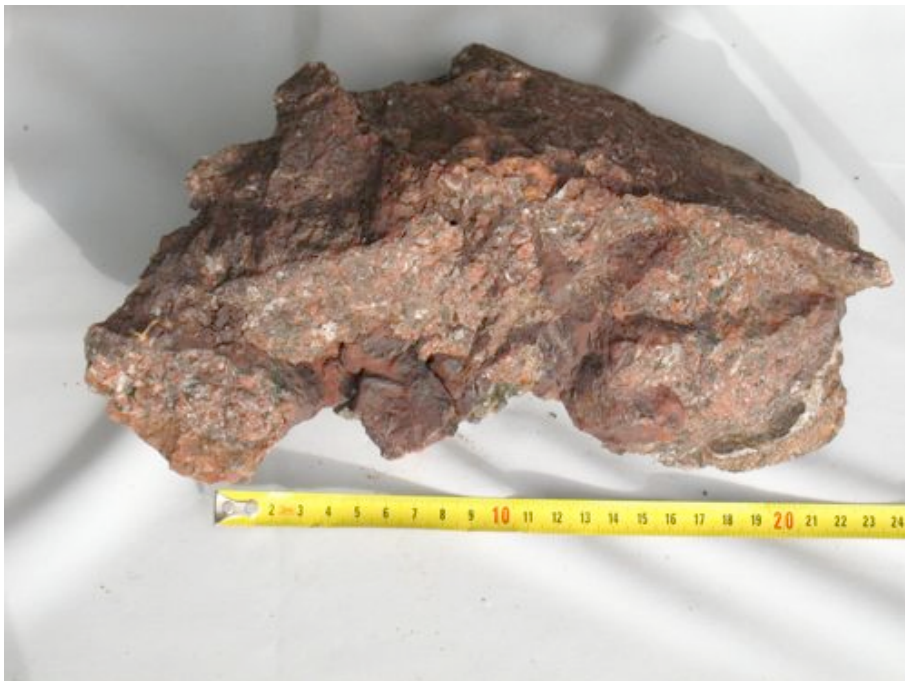
Fig. 16c: Sample of reconstructed granite with solid melt

Recently (August 2010) at (Pos. Q) several large blocks of shattered granite, cured by a melt, containing large inclusions of that melt have been found, see Fig. 16c. These samples are comparable with the bests from the Siljan-astrobleme.