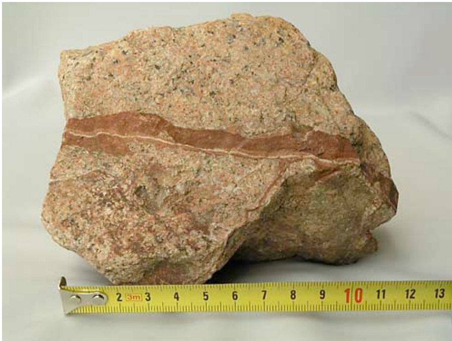
Fig. 20: Layer of melt through granite. The thin white band is a late quartz impregnation along the old fracture zone (Pos. T).

The centre of this supposed astrobleme is at 13 km west of the church at Siljansnäs at (Pos. S); its radius is 3 km. During the first inspection this author reacted upon the rich vegetation along the small river Långsån, which indicates carbonate. This could be due to local residues of the former carbonate cover or material from the nearby Siljan-astrobleme, conveyed there by the Holocene ice. At (Pos. T), in a gravel pit, a large fraction of the boulders is affected by an impact. Pure melt is rare, as shown in Fig. 20; Fig. 21 shows the cracked and quartz-cured rock. However, in a nearby large gravel pit at (Pos. U), about 3,5 km south of (Pos. T), impact-affected boulders are missing. Therefore those from (Pos. T) can be local.